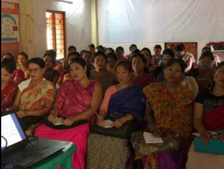
Block Level LRG orientation on GPDP & Gram Sabha in Keirao-Bitra Block