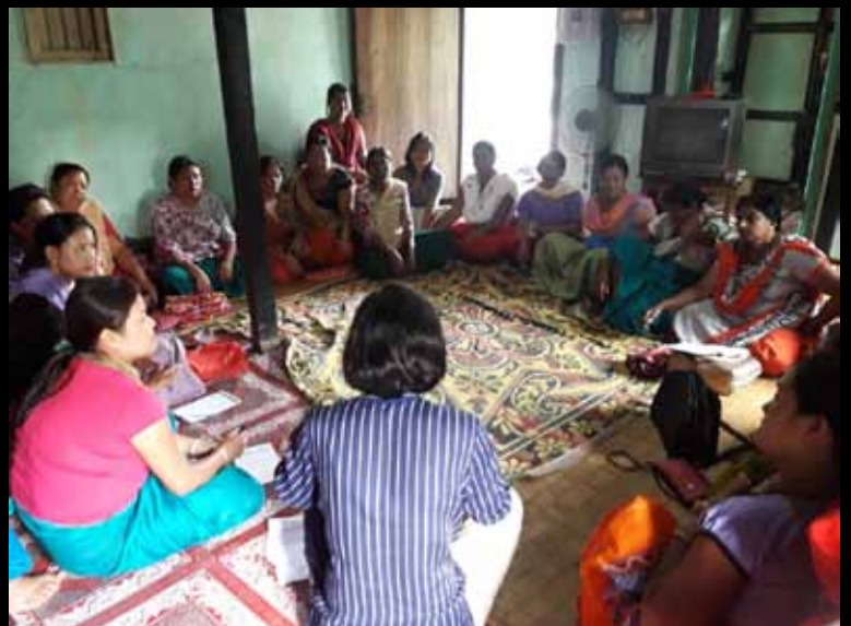
Meeting with the AAW, ASHA conducted by VLF about GPDP & Gram Sabha