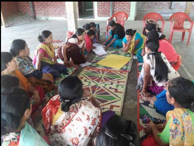
Demand consolidation at VLF