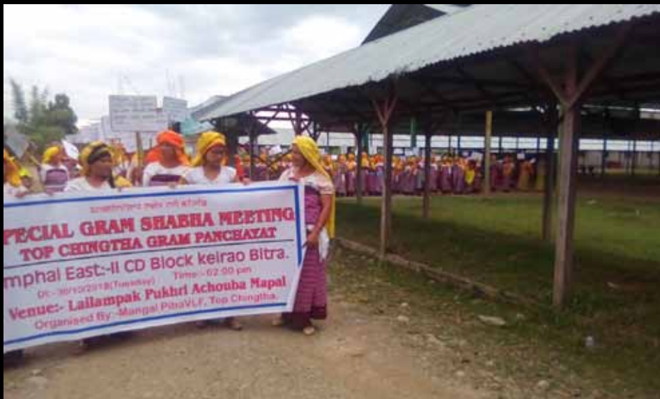
Special Gram Sabha Mass Rally at Top Chingtha G.P