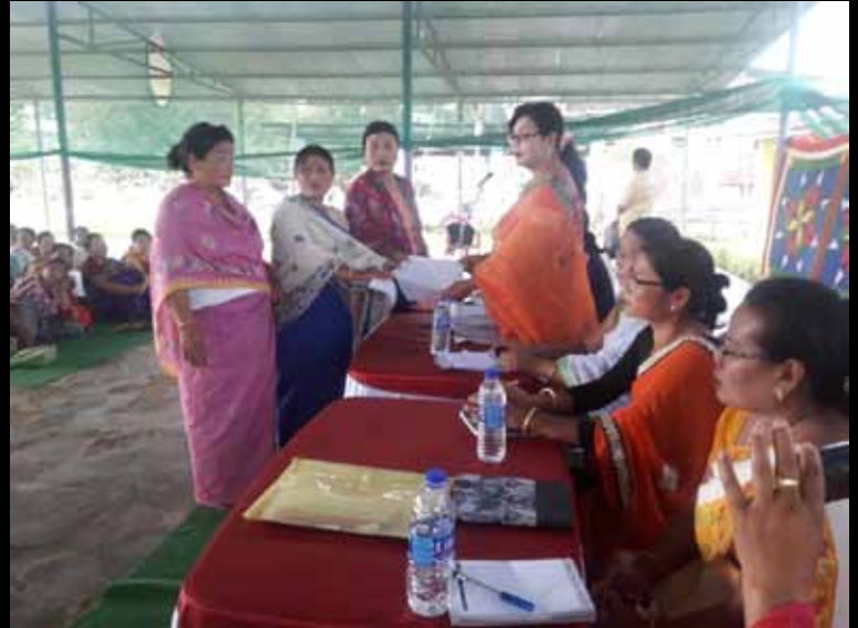
VLF submitting the Demand proposal to the Pradhan in Top Dusara G.P, Keirao-Bitra Block