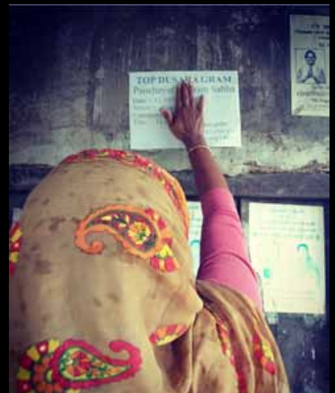
Mobilization through posters