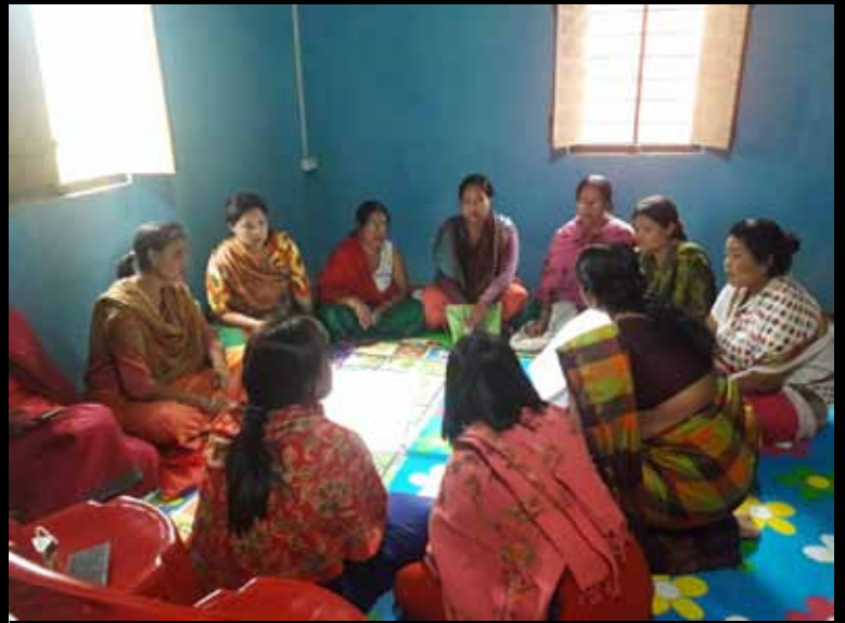
Data collection at SHG level by LRG in Top Dusara G.P, Keirao-Bitra Block