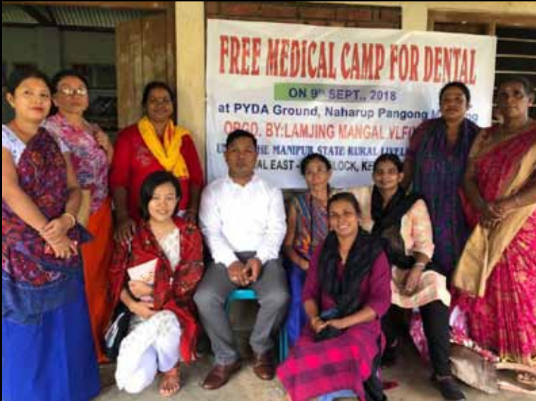
Free Dental Camp organised by Lamjing Nagpal VLF at PYDA ground, Naharup Pangong