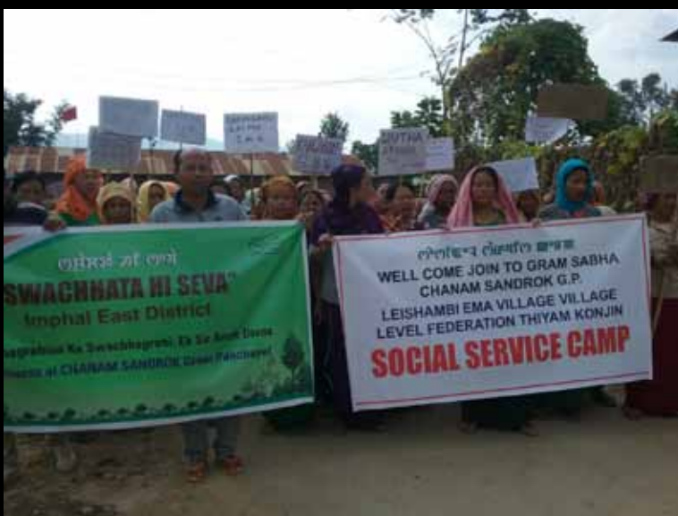
Panchayat Pradhan's participation during Gram Sabha mobilization in Chanam Sandrok G.P