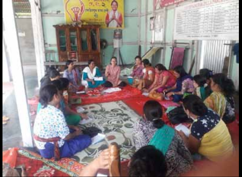
Orientation on GPDP at VLF level in Top Naoria G.P, Keirao-Bitra Block